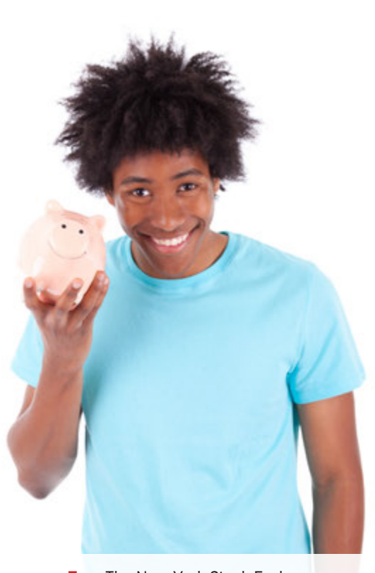
Top: The New York Stock Exchange on Wall Street in New York City is the world's largest stock exchange. Above: A student might save money in a piggy bank, but the money will not grow or earn interest.